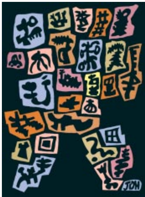
Walker , ed: 30, sh: 29.75"h. x 21.75"w.