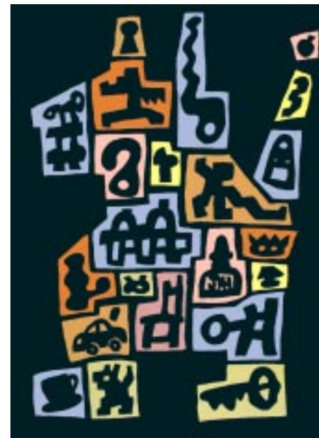
Apple Tail Double Dog , ed: 30, sh: 29.75"h. x 21.75"w.