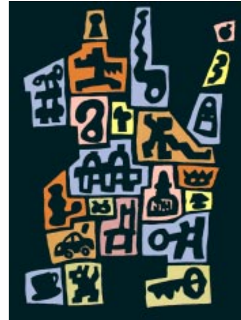
Apple Tail Double Dog , ed: 30, sh: 29.75"h. x 21.75"w.